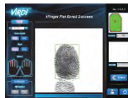
Single Flat Enrollment