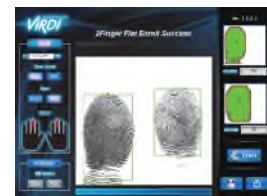
Dual Flat Enrollment